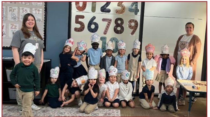
Preschool students showcasing their 100 th day headbands.