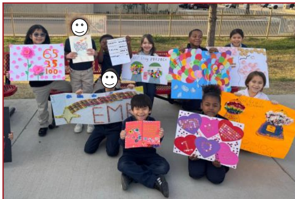
First grade students showcasing their 100 th day projects.