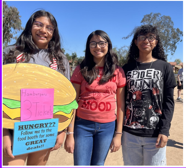
Students have fun at the Spring Fling.